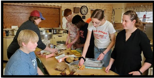
Mission team members prepare dessert trays for their fundraiser.